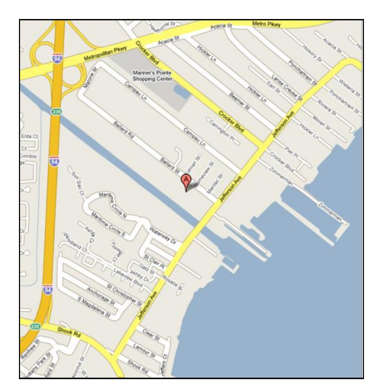
The L'Anse Creuse Amateur Radio Club meets at 7:00 pm the first Wednesday of each month, except during July and August. Meetings are held at Tucker Senior Center located at 26980 Ballard St. Harrison Township, MI 48045 unless indicated otherwise in the most current issue of the Tuned Circuit. Call-in on the Echo Repeater (N8LC) on 147.08 MHz (+ 600 KHz, 100 Hz PL tone) for any meeting information, or to ask a member for the location of the meeting.